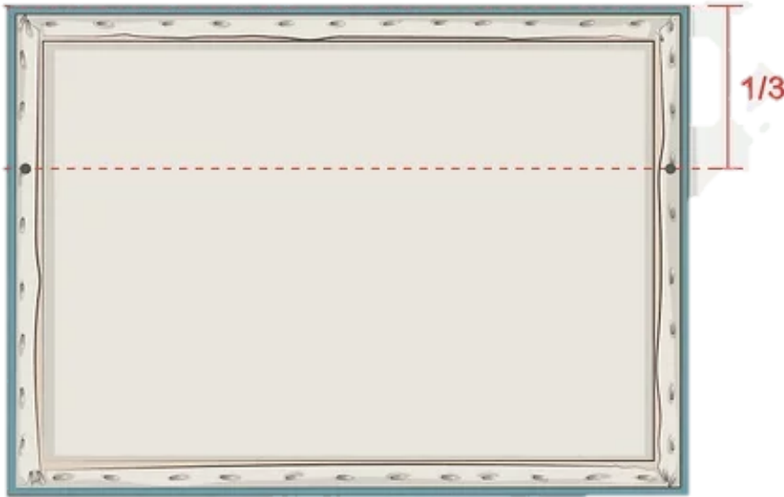
Fig 1. One third of the way down on your artwork

D hooks should be attached a third of the way down a painting with the d-hook facing the inside of the painting. To find the height of one third, measure the height of your painting and divide by 3. This will be one third.