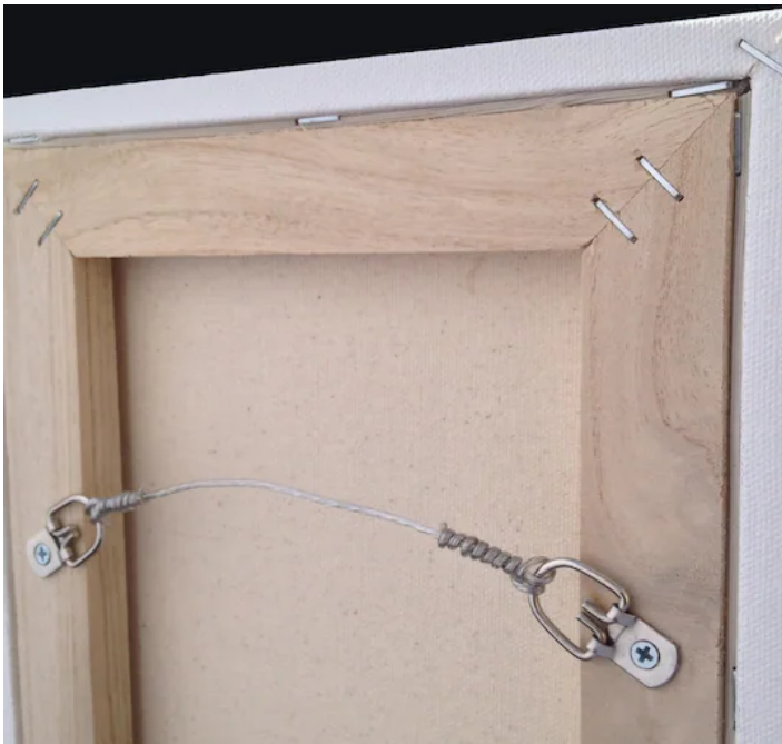
Fig. 4 - D-hooks facing inward with plastic coated wire. Wire is fastened with a cow hitch and the ends are wrapped. Please remember to tape the wire ends.