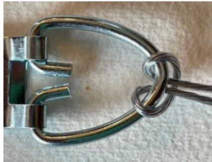
Fig. 2- Slip knot with ends wrapped.