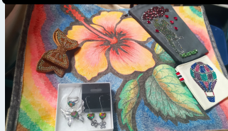
ARTSYLADY ART & GLASS CINDY FRIESEN-FORD ASHURST