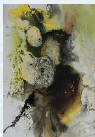
MELISSA WOODCOCK FINE ART